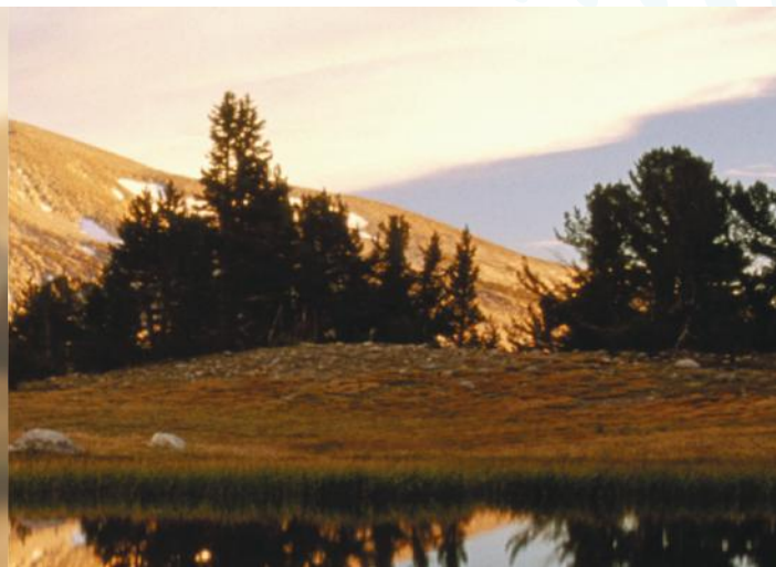
Image without cataracts